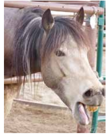
Coughing can be another symptom of choke

Ensure any changes to the feed or forage is done on a gradual basis.