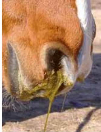
Due to the blockage food can return down the nostrils